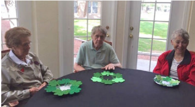
Volunteer time at The Inn

Residents at The Arbor Ridge enjoyed themselves at an Irish Pub during one of our Monday Lunch Bunch Outings. A group of our residents volunteered at The Inn to help those residents make a beautiful St. Patrick's Day Wreath.