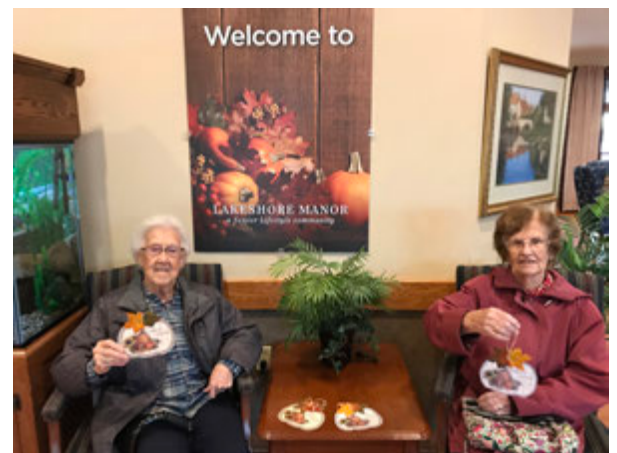
The residents at Bella Vista delivered door decorations to our sister community Lakeshore Manor!