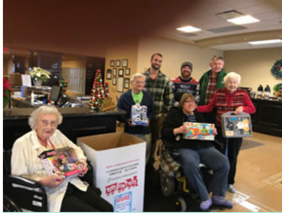
Bella Vista residents participated in collecting Toys for Tots!