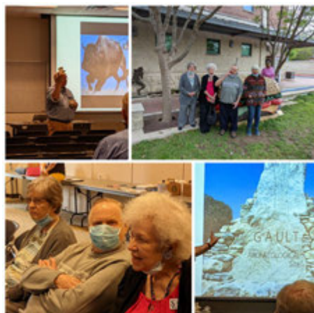
Love Our Earthly Georgetown