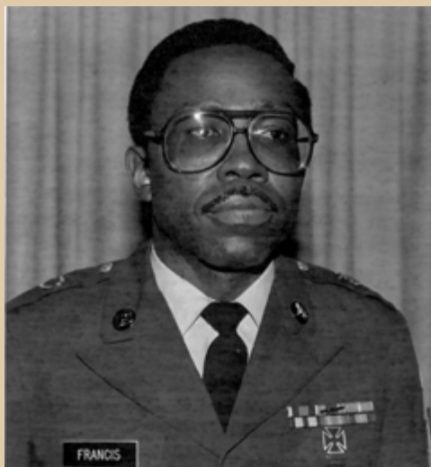
US Army, First Sergeant, 23 years of service