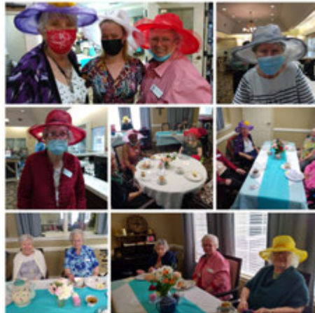
Mother's Day Afternoon Tea