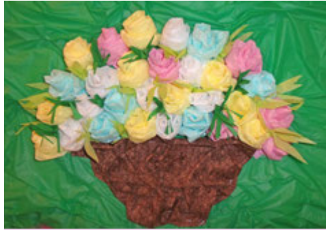
The Management of The Pointe would like to thank everyone who helped make the Beauty In Bloom event especially beautiful.