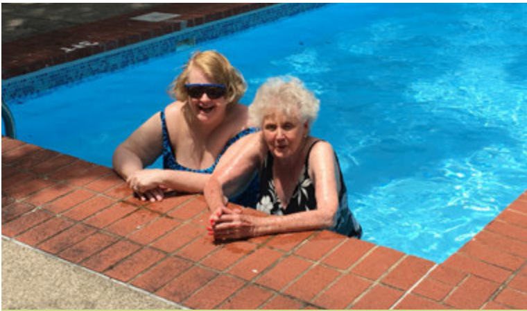
Good times — the pool is waiting for you!