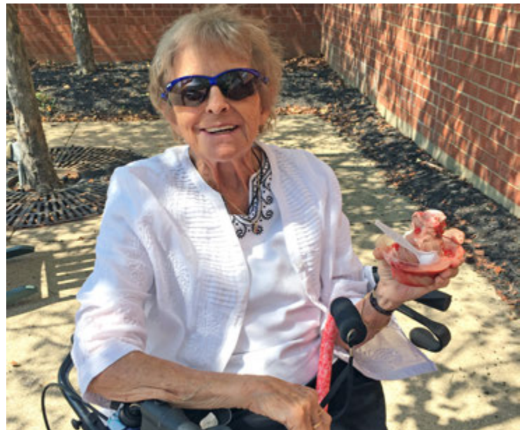
Mr. Softee Ice Cream Truck — the perfect treat