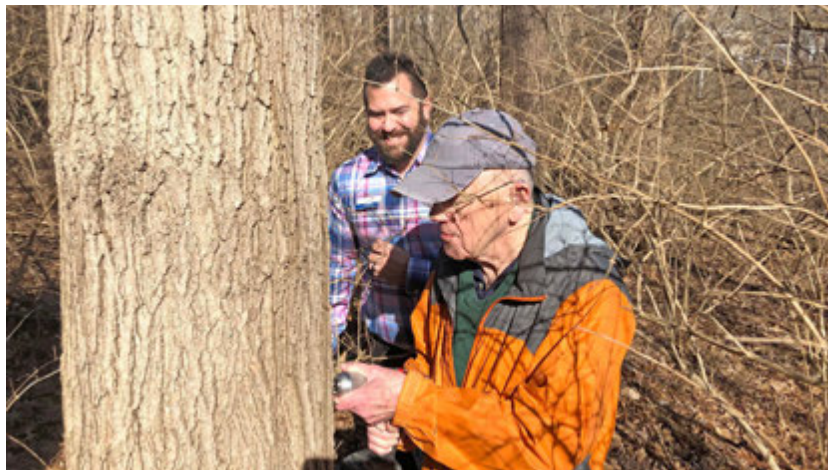
Coming soon — maple syrup!