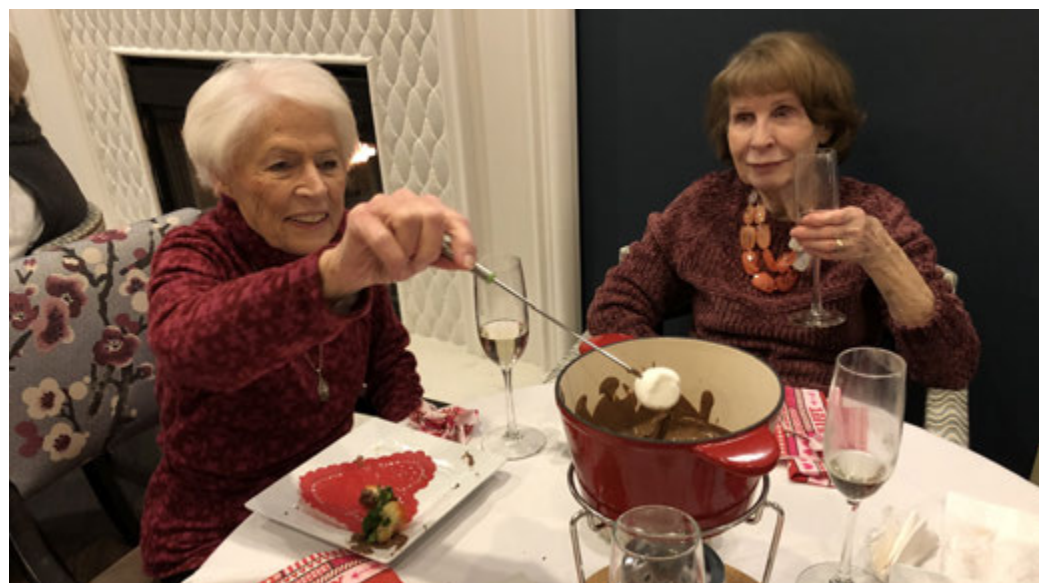
Chocolate fondue parties for Valentine's Day