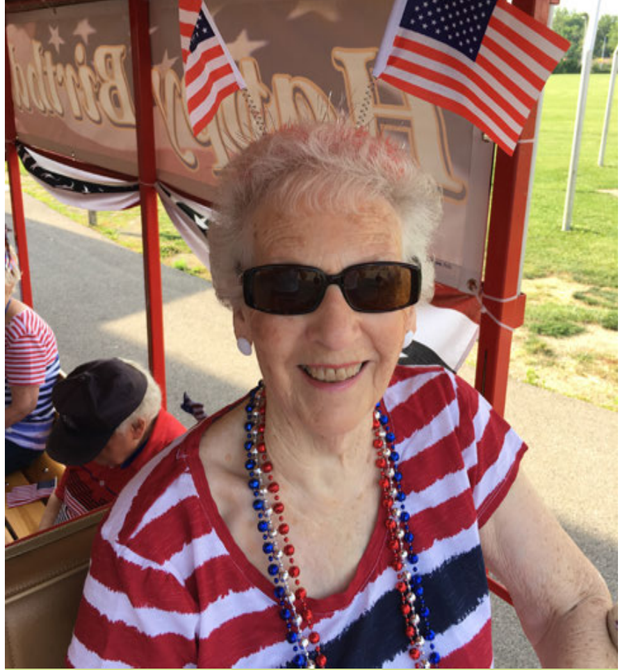
Good times — riding in the carriage in the Montgomery July 4th Parade