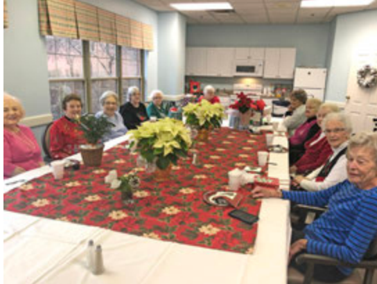
Secret Santa Brunch