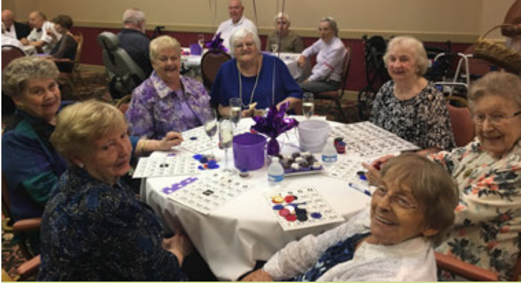
Good Times for a Good Cause — Black Tie Bingo for The Alzheimer’s Association.