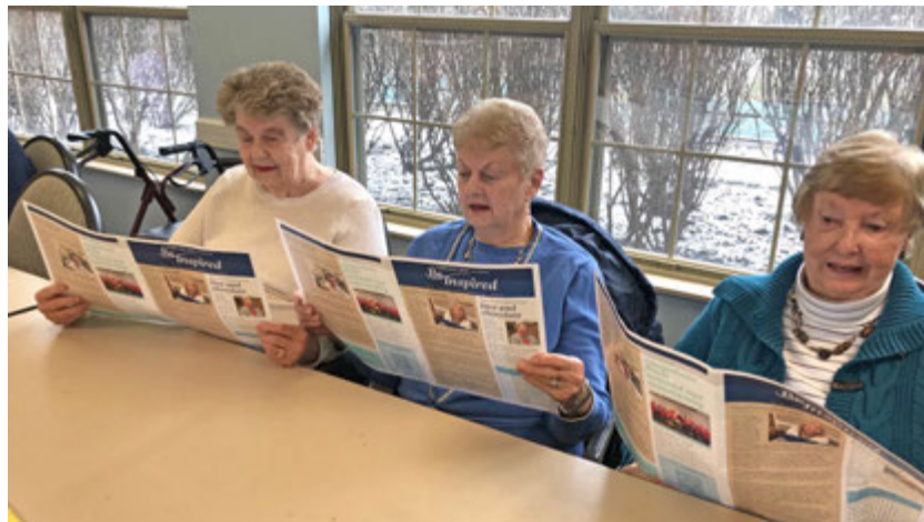
Don't miss a thing — read your newsletter!