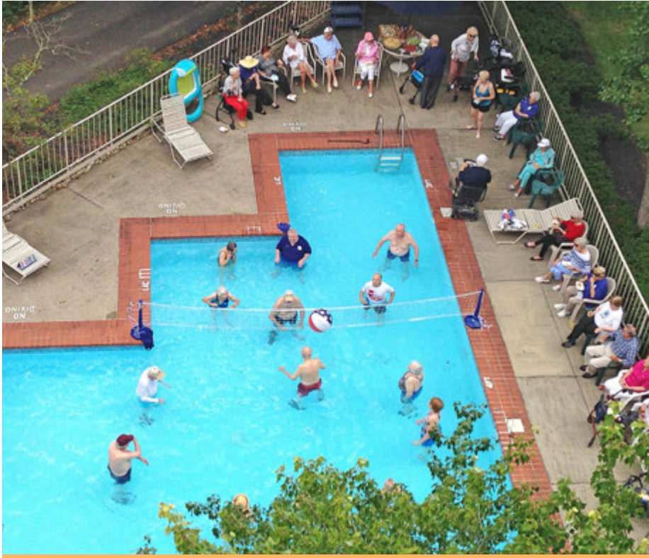
Seasons Slammers played pool volleyball while their fans had cocktails and snacks poolside.

WITH LOBSTER, ICE CREAM AND POOL VOLLEYBALL