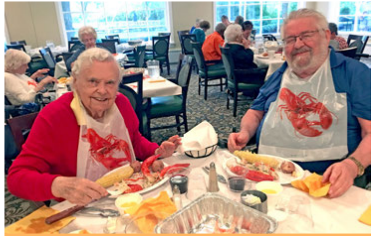
Our Fifth Annual Lobster Dinner