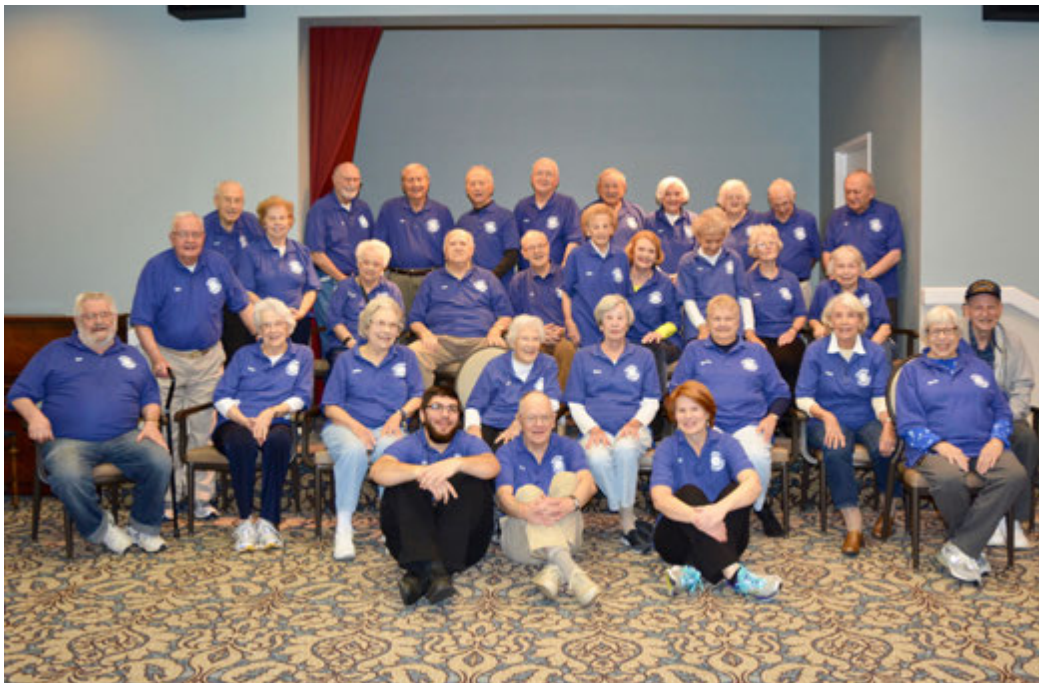
Seasons Slammers gathered for their Awards Ceremony.