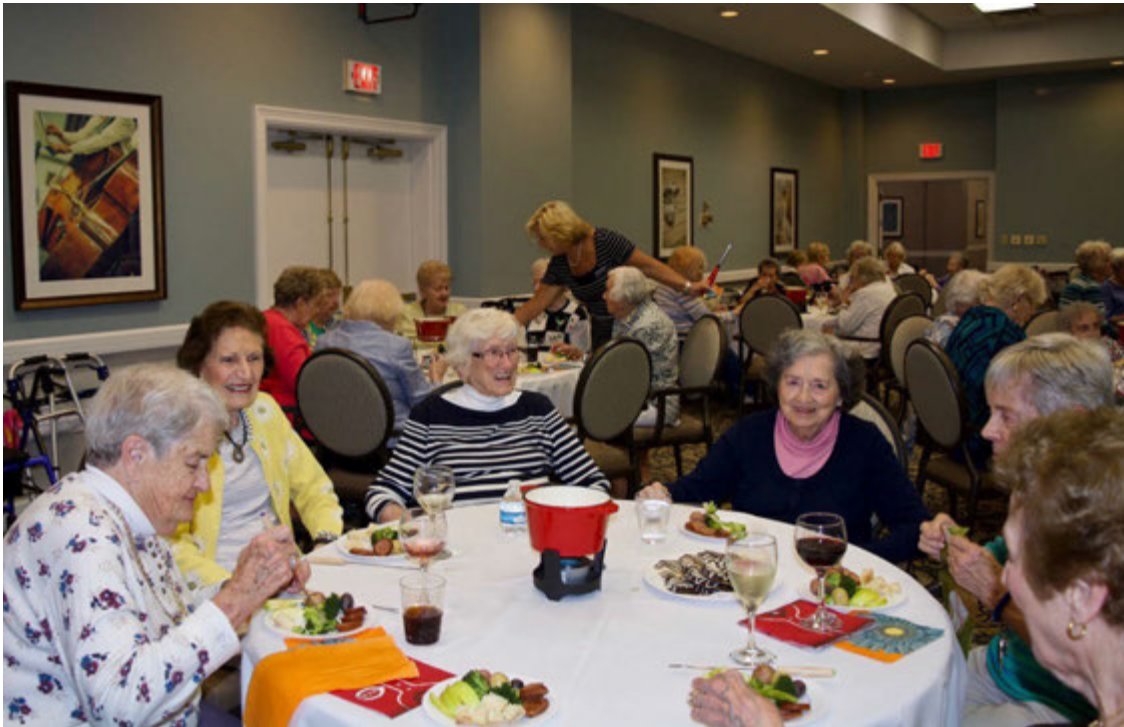
Ladies' Night — cheese fondue, wine and a movie