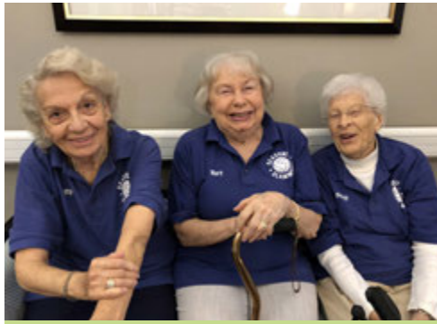
Who's ready for some volleyball? Everyone is welcome to join our Seasons Slammers team!