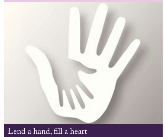
Lend a hand, fill a heart

The most fulfilled people are the ones who get up every morning and stand for something larger than themselves. They are the people who care about others, who will extend a helping hand to someone in need like a new resident moving into a new community where they really don’t know anyone or what to do at first. Will you be that person to give them the hand that they truly need? We need to show our old, new and visiting residents that we really do think of others before we think about us. The greatest place to find a helping hand is at the end of your own arm.